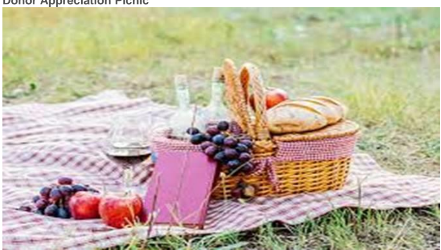
SOLWW Donor Appreciation Picnic